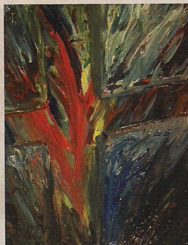
In addition to running art classes for people in need, Sanctuary London offers several weekday drop-ins, meals, a Bible study, and a worship service.